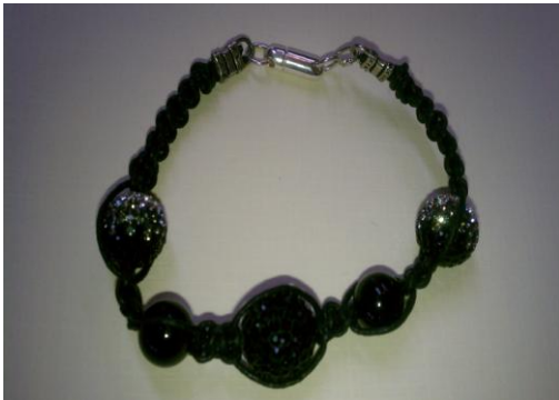
Shamballa with Magnetic Clasp

Planning a Large Corporate Event? The World Of Beads offers jewelry making classes at a location of your choosing.