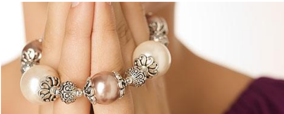
Straight strung with high quality silver plate. Could replace pearls with other beads of your choice (average kit price $15 and up based on bead selection).

Thank you for your inquiry. We have gone on location many times providing class instruction for large corporate groups. Our instructor fee's average $18 - $28 per student based on group size, chosen project and time required to complete project.