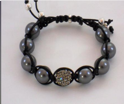
Shamballa with adjustable clasp